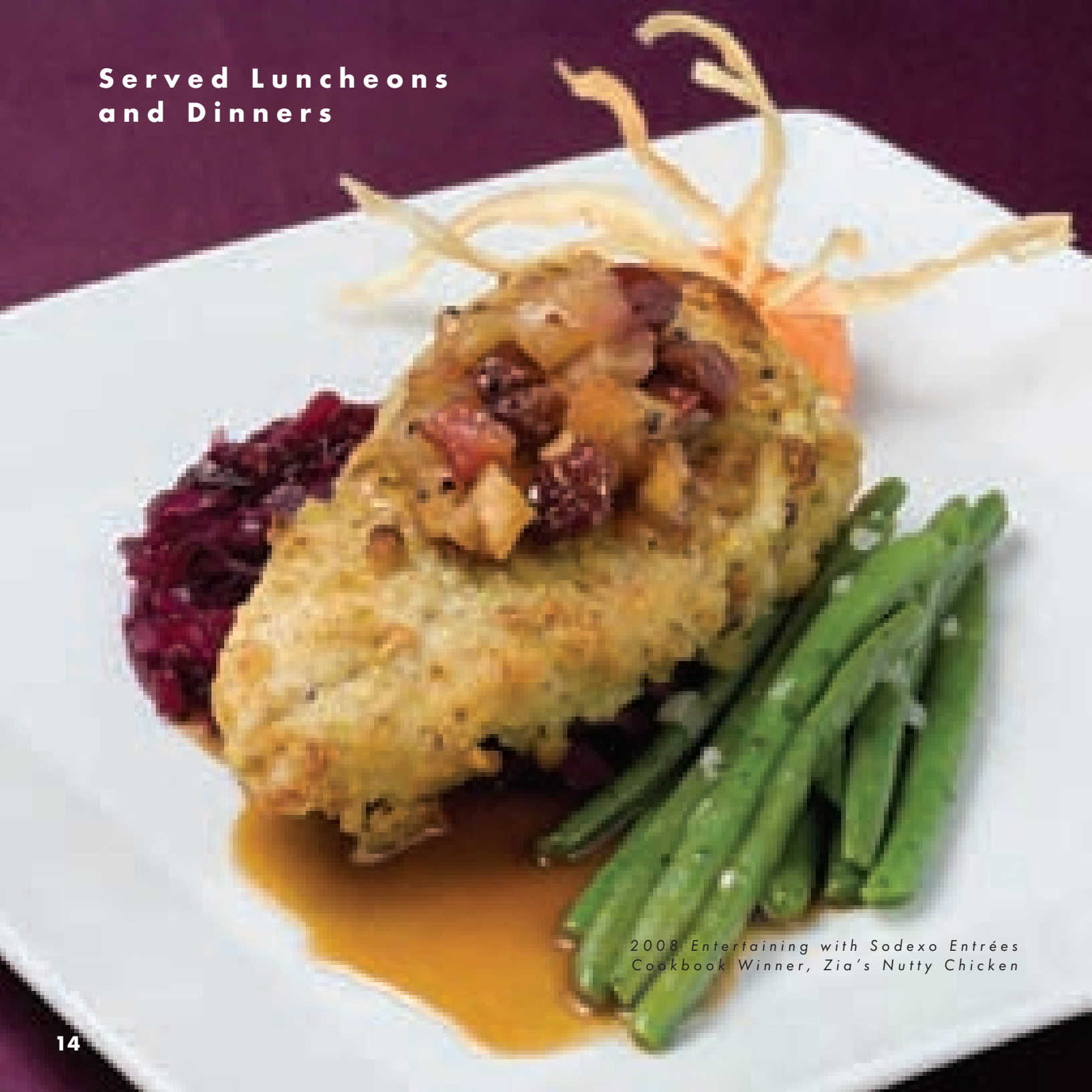
2008 Entertaining with Sodexo Entrées Cookbook Winner, Zia's Nutty Chicken